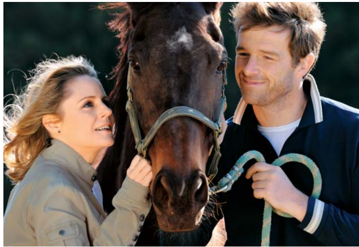
Focal length: 300mm Exposure: F/8 1/160 sec ISO400 WB: Daylight Handheld