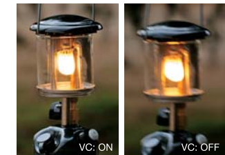
Focal length: 300mm Exposure: F/11 1/30 sec With VC, the photographer can shoot at a shutter speed up to four stops slower.

The new optical design of Tamron's advanced telephoto zoom lens delivers a whole new world of possibilities. It allows the photographer to draw the subject close and separate them from their background, creating photographs with spectacular contrast and depth. This lens also boasts Tamron's USD (Ultrasonic Silent Drive) and proprietary VC (Vibration Compensation) image stabilization. It gives the photographer the ability to capture fast moving subjects without blurring even in low light, and its new optical design that employs an XLD (Extra Low Dispersion) lens element made with highly specialized glass delivers crisp, clear images with sharp contrast.