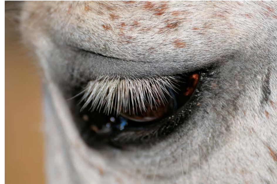
Focal length: 300mm (equivalent to 465mm) Exposure: F/5.6 Aperture fully opened 1/1000 sec ISO400 WB: Daylight Handheld (Digital SLR camera with sensor equivalent to APS-C size)