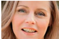
300mm (equivalent to 465mm)