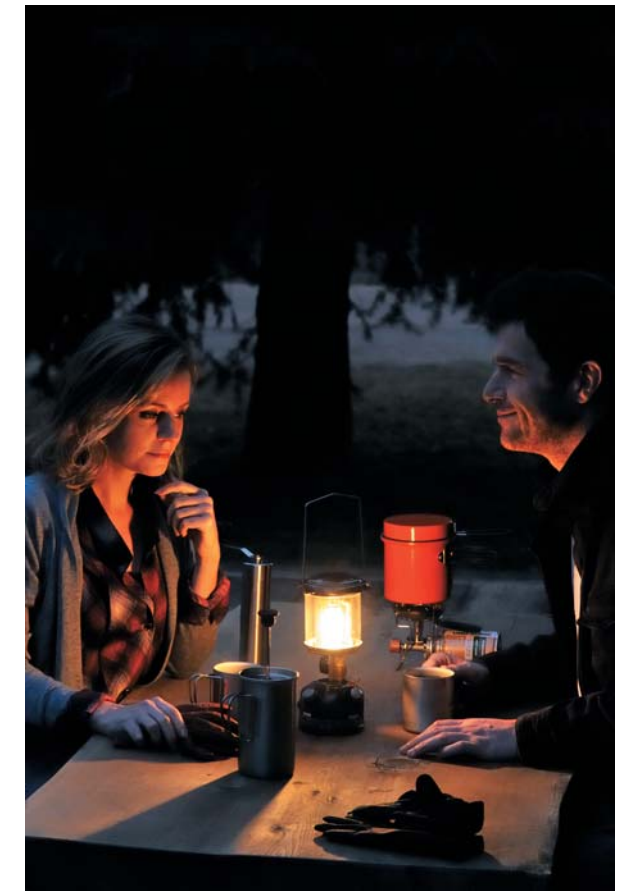
Focal length: 70mm (equivalent to 109mm) Exposure: F/7.1 1/8 sec ISO800 WB: Daylight Handheld (Digital SLR camera with sensor equivalent to APS-C size)

With an XLD lens element to deliver high resolution, image stabilization and a turbo speed silent autofocus, Tamron's new telephoto zoom makes it easy to capture the most difficult shots. Introducing the new SP 70-300mm F/4-5.6 Di VC USD.