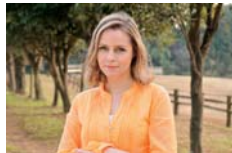
70mm (equivalent to 109mm)