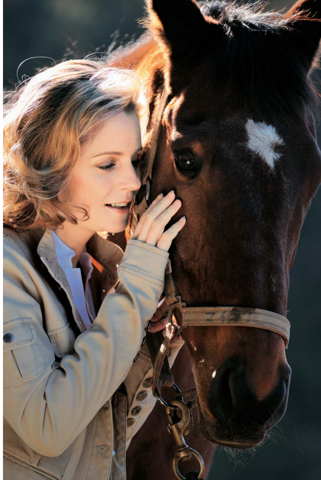
Focal length: 300mm Exposure: F/5.6 Aperture fully opened 1/200 sec ISO200 WB: Daylight Handheld