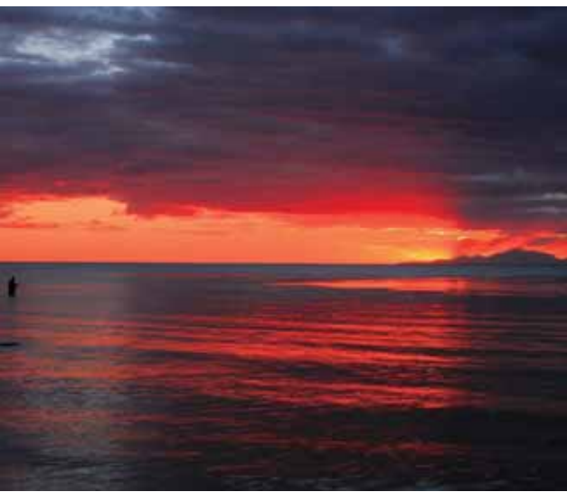
Exposure: F/11 Auto ISO100 RAW