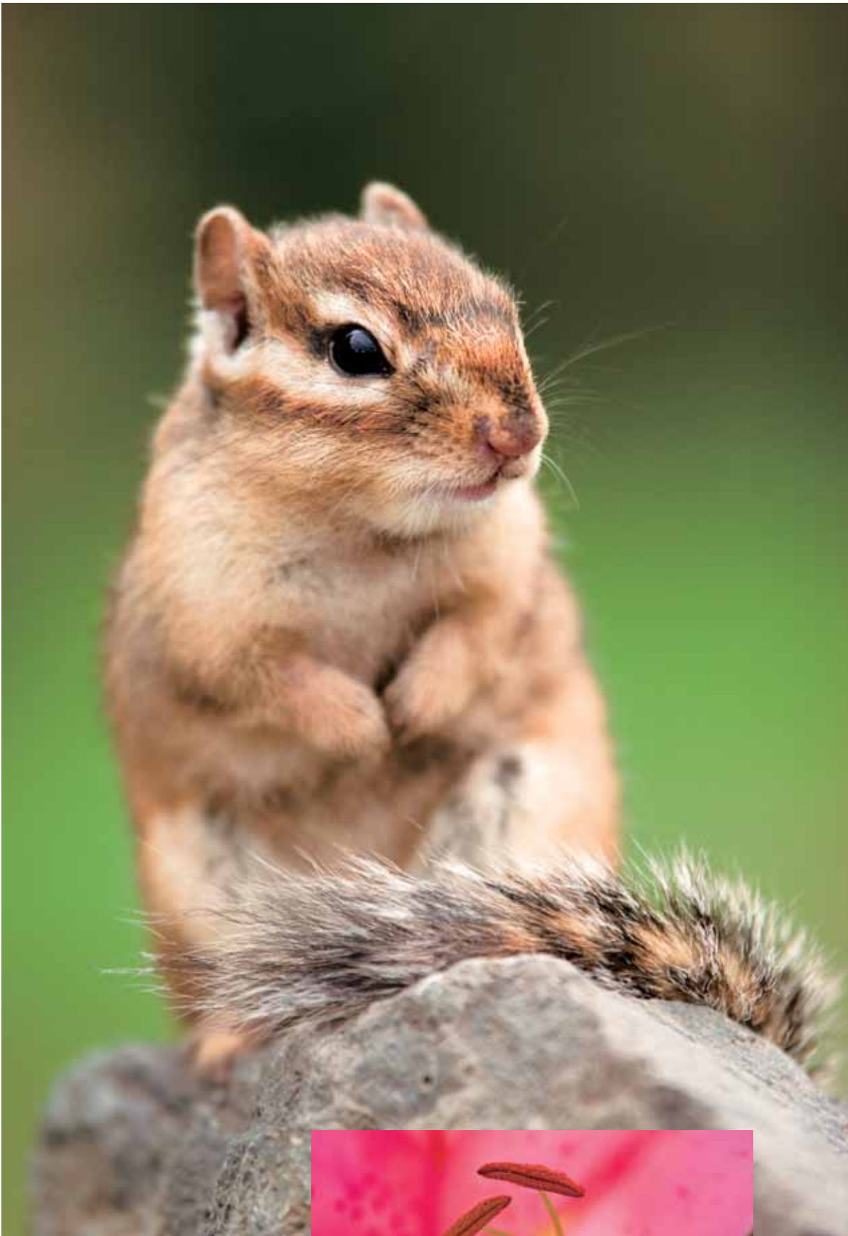
\frac{12'21''}{200\text{mm}} (Equivalent to 310mm) Exposure : Aperture fully opened Auto ISO400 RAW (image taken with a digital SLR camera with an APS-C size sensor)