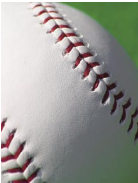
300mm (Equivalent to 465mm) Exposure: F/9.5 Auto ISO100 MFD: 0.95m (Max. Mag. Ratio: 1:2)* * Switching to macro mode.