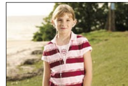
70mm (Equivalent to 109mm)