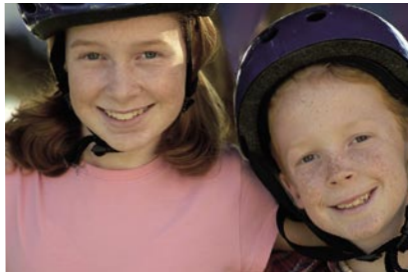
70mm (Equivalent to 109mm) Exposure: Aperture Fully Opened Auto ISO400

* Multi-layer coatings on cemented surfaces of plural elements