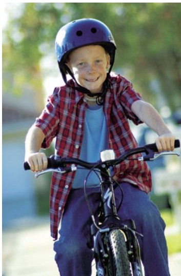
300mm (Equivalent to 465mm) Exposure: Aperture Fully Opened Auto ISO400