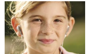
300mm (Equivalent to 465mm)